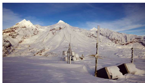
Typical monitoring station with Crater Peak and Mount Spurr in the background.

Mount Spurr is one of the best monitored volcanoes in Alaska and has a network of instruments that send data in real time to AVO. Staff use satellite, seismic, deformation, and infrasound data to assess activity levels at all active volcanoes in Alaska, including Mount Spurr. Detailed records of eruptions, pilot reports, and monitoring data help AVO staff provide information before, during, and after a volcanic event.