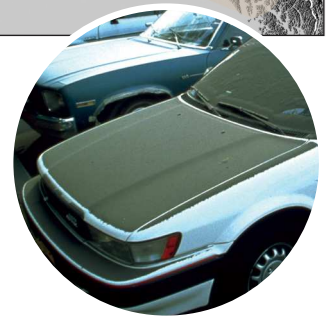
Inset photo. Ashfall on vehicle in Anchorage from Crater Peak eruption, August 18, 1992.