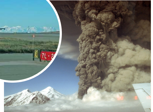
Column of ash rising from Crater Peak during the eruption on August 18, 1992. Inset photo. Anchorage International airport is 80 miles from Mount Spurr, visible here behind a landing airplane.

Administration (FAA) and the National Weather Service (NWS), who issue warnings about airborne volcanic ash to pilots.